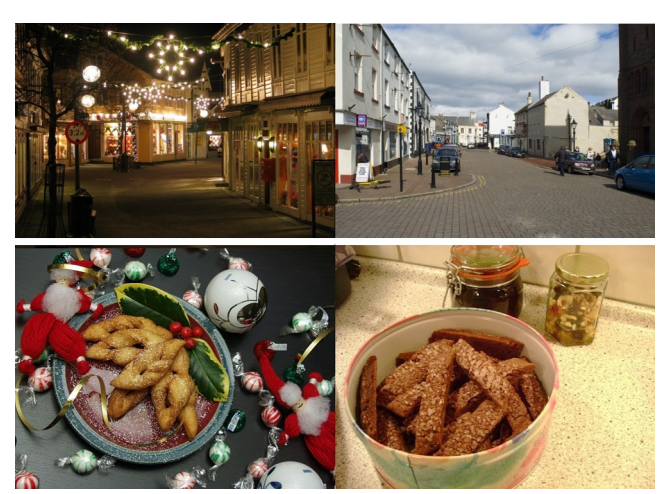
Fig 1 Four examples from image series viewed by participants, which represent images with and without Christmas theme