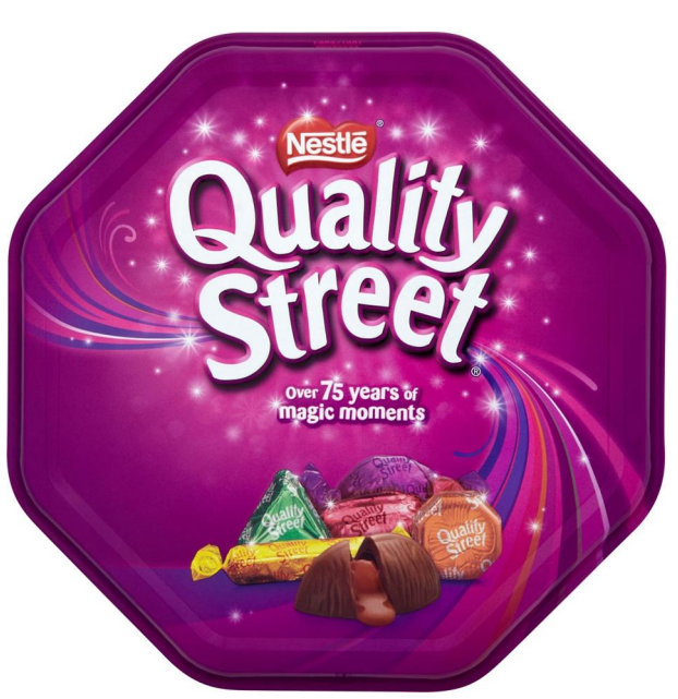
Or are these more up your street?