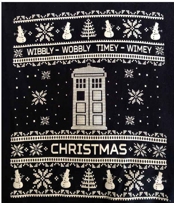
Fig 1 | The TARDIS has even landed on a Christmas jumper

The main outcome was age standardised mortality rate because, unlike crude rates, this allows a fairer comparison between populations with different age structures over time. The ONS standardises the data to the 2013 European standard population. Rates were analysed from 1964 (the year after Doctor Who was first broadcast) onwards, but to avoid confounding from the covid-19 pandemic, data after 2019 were not included. Analyses were first conducted using the age