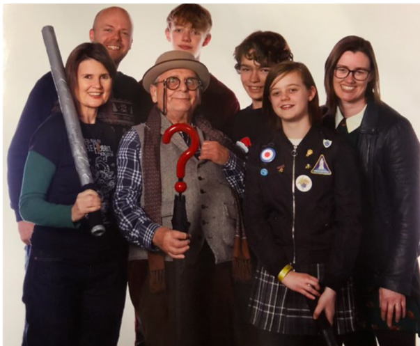
Fig 2 | Lead researcher (top left) and family members with actor Sylvester McCoy (holding umbrella) who played the seventh Doctor in Doctor Who , and actor Sophie Aldred (with baton) who played the Doctor's companion, Ace

To answer the research question, the regression also included a binary covariate for festive broadcast group (was Doctor Who broadcast during the previous festive period? 1 yes, 0 no), to estimate whether Doctor Who festive broadcasts are associated with a change in the subsequent annual mortality rate, after accounting for the general non-linear reduction in rates over time. This was then repeated to examine the binary covariate